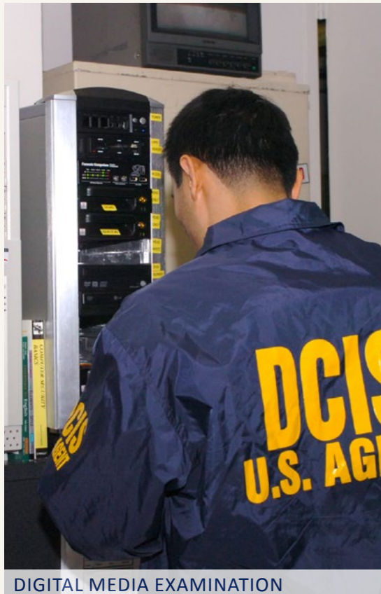
DIGITAL MEDIA EXAMINATION