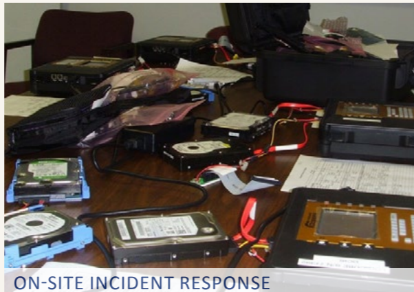
ON-SITE INCIDENT RESPONSE